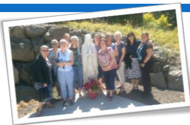
MI Star of the Sea Village, Bremerton, WA

In 2004, our family consecrated itself to Our Lady in the Militia of the Immaculata (MI). The journey to consecration began in 2003 with a visit to the site of the miraculous apparitions at the Rue du Bac in Paris. While there, with my teenage daughters, I prayed wholeheartedly to Our Lady with the intercession of St. Catherine for a "growth in holiness" for our family. As I knelt there, in front of the Saint's incorrupt body, my daughters were pacing the chapel, ready to sprint to our next destination. A Mass was beginning and I remember thinking that we were so blessed and I wanted to stay. Attending one more Mass, not in English, was the last thing my nearly heathen (at the time) daughters had any intention of sitting through; so balancing my own energy to fight yet another battle and finding my resolve weakening, we left the chapel to explore more of the city. But not before I sent a postcard to myself from the holy place. Just recently I found the